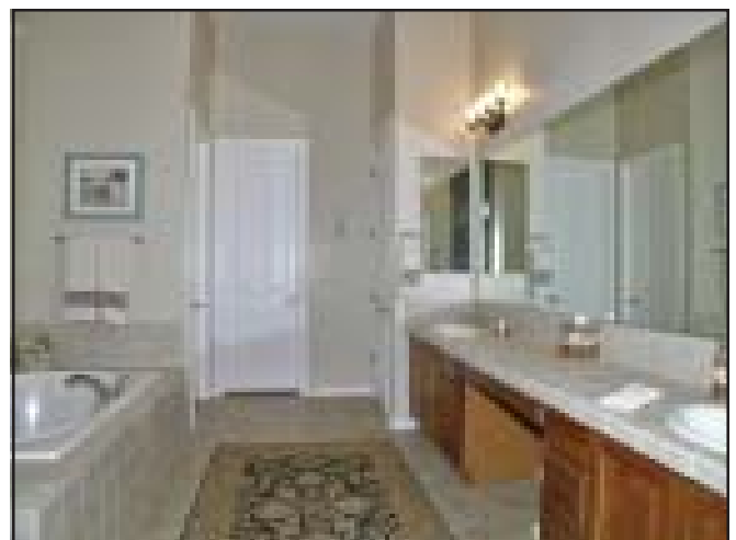
Master Bath features large Tub & Separate Shower, New Light Fixtures with matching bath accessories, Tiled Tub/ Shower/Vanity, Cherry Cabinets, and 2-tone Paint.