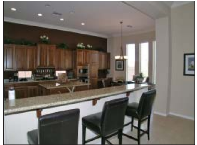
Kitchen features Granite-slab Countertops, Upgraded Cherry Cabinets, Stainless-steel Appliances, Stainless-steel Sink & Faucet, New Light Fixture in Nook, 8" Crown Molding, Real Wood 2.5" Horizontal Blinds. 3-tone Paint.