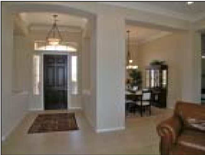
Entry Foyer has a New Light Fixture, 8" Crown Molding, Granite-slab Niche Countertops and 2-tone Paint. The Formal Dining Room has a New Light Fixture, 8" Crown Molding, and 2-tone Paint. The Foyer and Dining Room Windows have Real Wood 2.5" Horizontal Blinds.