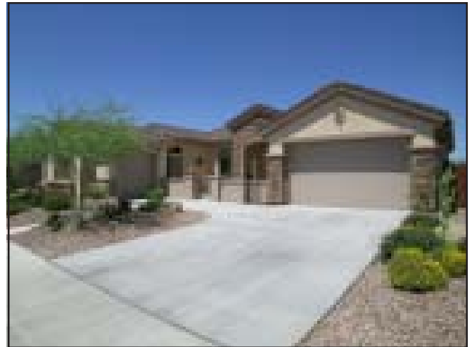
This Home has Great Curb Appeal, featuring a 2-Car Garage & Separate 1-Car Garage, Upgraded Elevation "B" with Stone, Professional Desert Landscaping, Lighted Flagstone Walkway, Large Courtyard with Flagstone Floor, Custom Locking Gate, and Entry Lights.