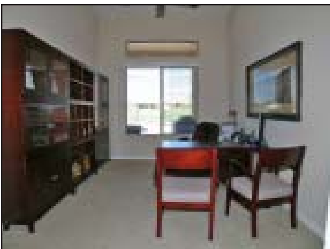
Den/Study features a Window with a View of the Golf Green & Pond, Upgraded Carpet & Pad, Recessed Lights, Built-in Speakers, Ceiling Fan, and 2-tone Paint.