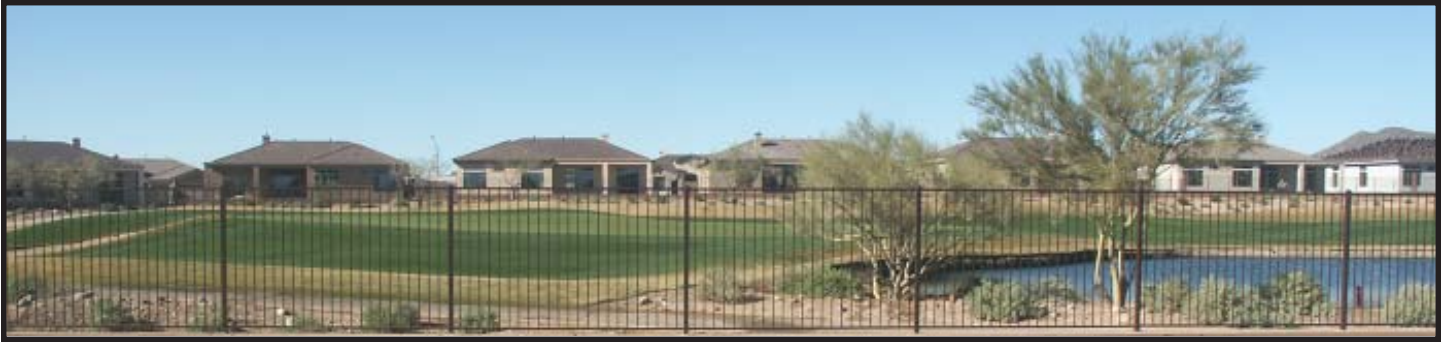
Fantastic View of 12th Hole Green, Water, and Daisy Mountain from Backyard